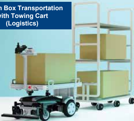
Carton Box Transportation with Towing Cart (Logistics)