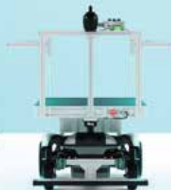
UV-C Light (Disinfection)